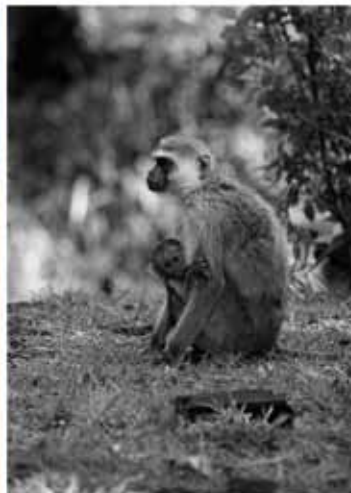
Judd Sher – An Eulogy to a Vanishing Africa (photomedia)