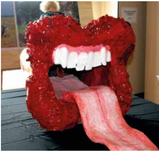
Dana Goldstein – Speaking Volumes (sculpture)