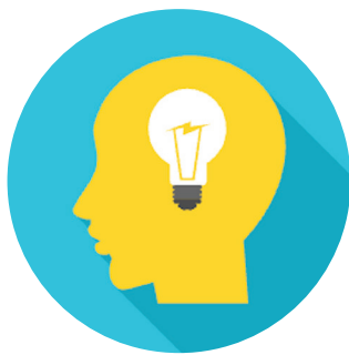
DEVELOPMENT DIGITAL BADGE